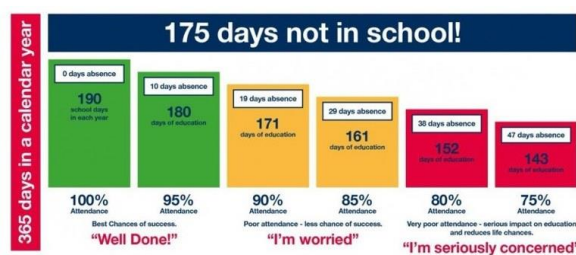
2 - Attendance Matters

Reminder: Since returning after Christmas, there has been an increase in jewellery being worn by the pupils. Can I just remind parents that due to health and safety grounds; we do not allow children to wear jewellery in our school. The exceptions to this rule are small ear studs in pierced ears, or a watch. We do ask the children to either remove these objects during PE and games, or cover them with a plaster, to prevent them from causing injury. Can I also remind parents that children should not be wearing make up or false/gel nails to school.